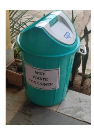
Pic: - Dry & Wet litter container placed in College Veranda