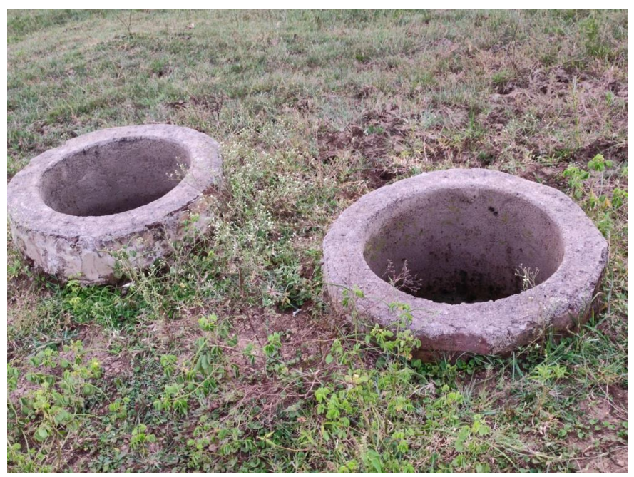
Pic:- Litter containers outside of the campus.